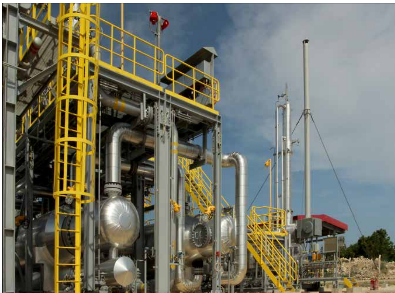
◆ Songo Songo Island Gas Processing Plant

In April 2016 pursuant to an option granted in 2015, Aminex has entered into an Asset Sale Agreement with Solo Oil plc for the sale of a further interest of up to 3.825% in the Kiliwani North Development Licence. The total consideration is approximately $2.17 million which will be used to retire debt and fund working capital requirements. On completion of this transaction and the exercise of a 5% back-in right by the Tanzania Petroleum Development Corporation, Aminex will retain a 51.75% interest in the revenues from the Kiliwani North Development Licence.