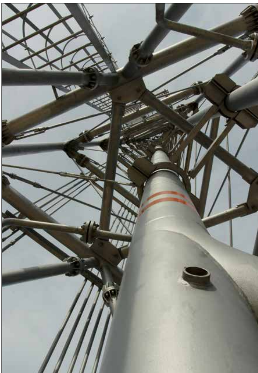
◆ Looking up the flare tower for the Songo Songo Island Gas Processing Plant

Aminex retains an interest under the terms of a partnership agreement with Valiexchimp SRL, the concession-holder of two licences for the Valeni and Victorovca oil and gas fields in the Republic of Moldova. As the Board considers the Moldovan assets not to be core to Aminex's business, no further wells are currently planned and the carrying value of the asset has been provided for in full as at 31 December 2015. Aminex continues to seek purchasers for the interest.