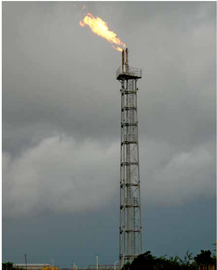
◆ Gas flare for Kiliwani North-1 prior to production in April 2016

Past months have not been easy in our sector in general but Aminex has successfully weathered many storms in the past and we expect to do so in the future. Tough times can present