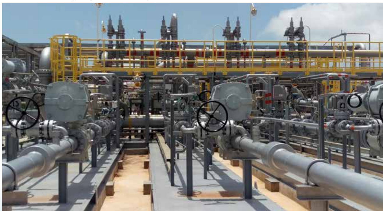
◆ Gas feed lines into the Songo Songo Island Gas Processing Plant