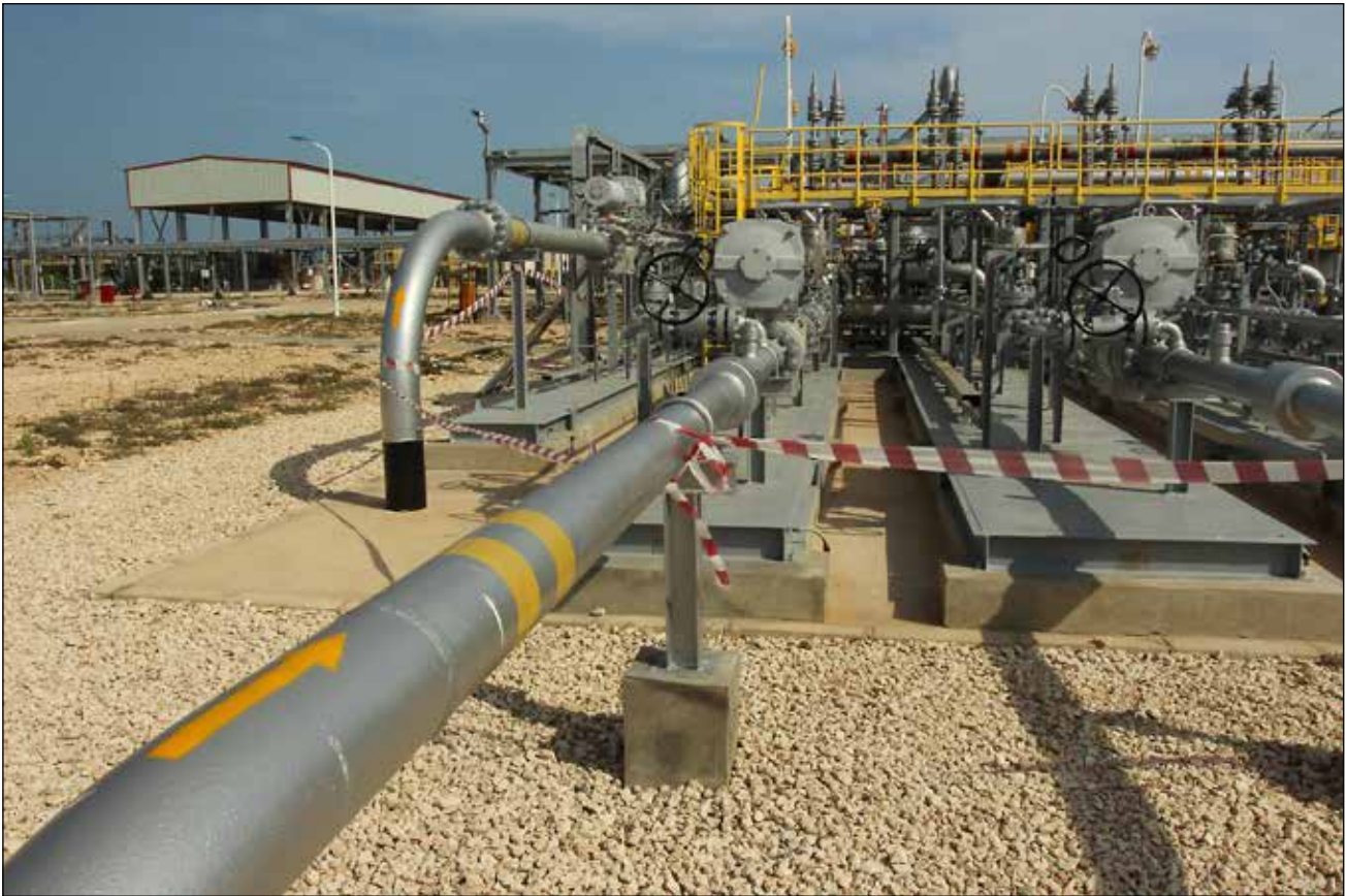
◆ KN-1 feed line into Songo Songo Island Gas Processing Plant

While Aminex is planning to recomplete Ntorya-1 and drill two new offset wells, the Ntorya-2 appraisal well and the Ntorya-3 exploration well, the programme will not fully complete the licence obligations. The Company is therefore in discussions with the TPDC regarding a delay or amendment to the work programme so that the development and early commercialisation of the Ntorya gas field can be prioritised. The Company believes that there is considerable further potential in the onshore Ruvuma Basin, which could provide significant value enhancement to the Company, particularly now that the new regional pipeline passes through the concession.