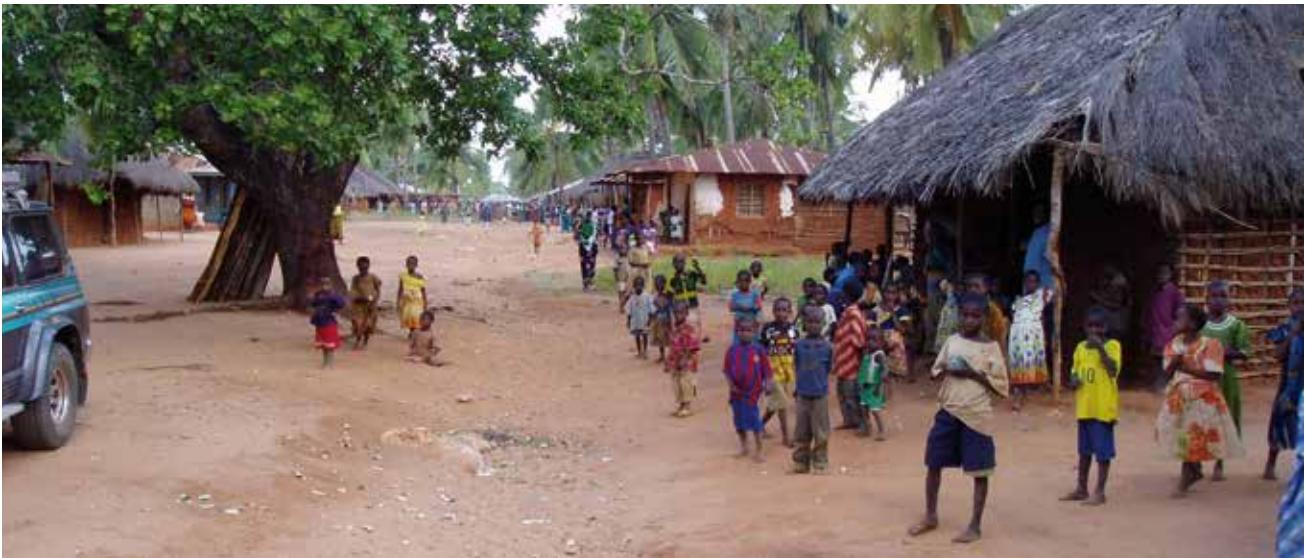
◆ Local village scene near Mtwara