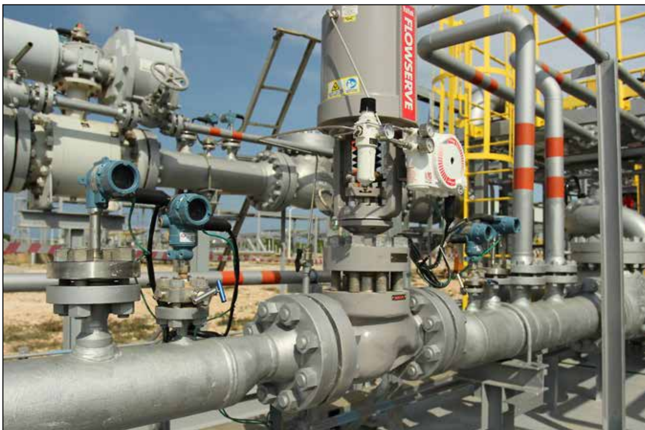
◆ KN-1 feed line into Songo Songo Island Gas Processing Plant, specifically showing the temperature and pressure gauges either side of the master valve

The carrying value of property, plant and equipment has decreased from $13.5 million at 31 December 2014 to $12.4 million at 31 December 2015, following the partial disposal of an interest in the Kiliwani North Development Licence with a cost of $1.35 million offset by a net increase in additions and foreign exchange movements of $0.24 million. The low oil price environment has reduced the fair value of the production payments up to a maximum of $4.5 million due from future production on the US assets by $0.97 million of which an amount of $0.85 million is considered to be a reduction in the non-current receivable from Northcote Energy Limited ('Northcote'), an AIM listed company. The Board has noted though that Northcote drilled the successful Lutcher Moore-20 well in the second half of 2015 and the well has been put on production since the year-end. The fair value of the interest in an investment in Northcote has also been reduced in the year. As part of the impairment review, the Directors concluded that, as a result of low oil prices and political instability in the country, the Moldova asset, which is considered non-core,